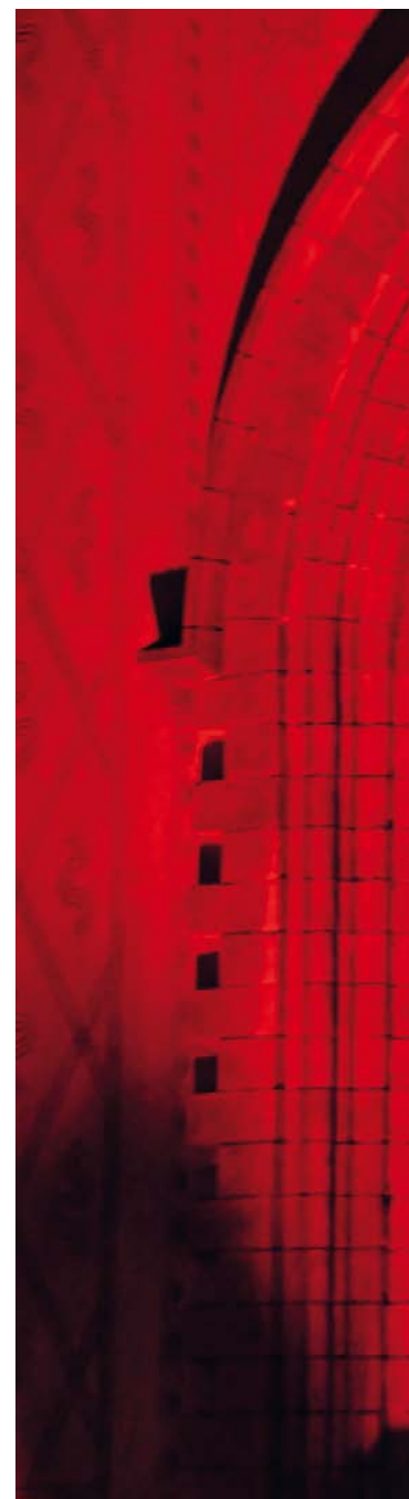
1-2 Medieval Sensation Colors: the installation for the Olgiate Comasco Conference Centre

The aim was also to avoid invading or damaging the existing plant and architecture as well as to effectively reuse apparatus that was already there. This was a technical challenge to bring out any potential there and to